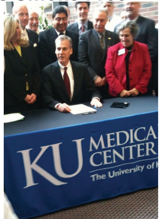
Kansas Governor Mark Parkinson at the ceremonial signing of the Kansas Clean Indoor Air Act with Johnson and Wyandotte County legislative champions.

The new law sets a floor of basic protections from secondhand smoke. Communities with stronger smoke-free ordinances will keep their existing